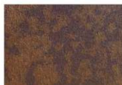
** Rustic Rawhide