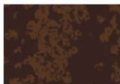
** Western Rust