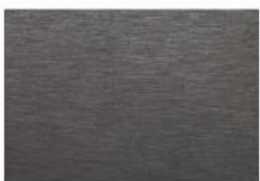
** Black Ore