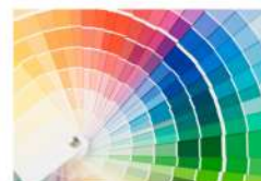
** Custom Color